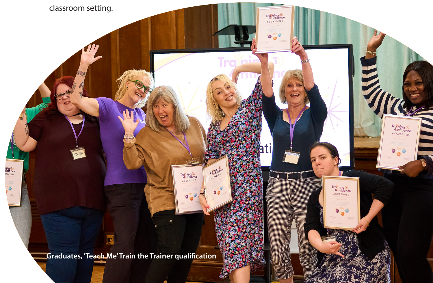
Graduates, 'Teach Me' Train the Trainer qualification

Graduate from the 'Teach Me' Train the Trainer qualification.